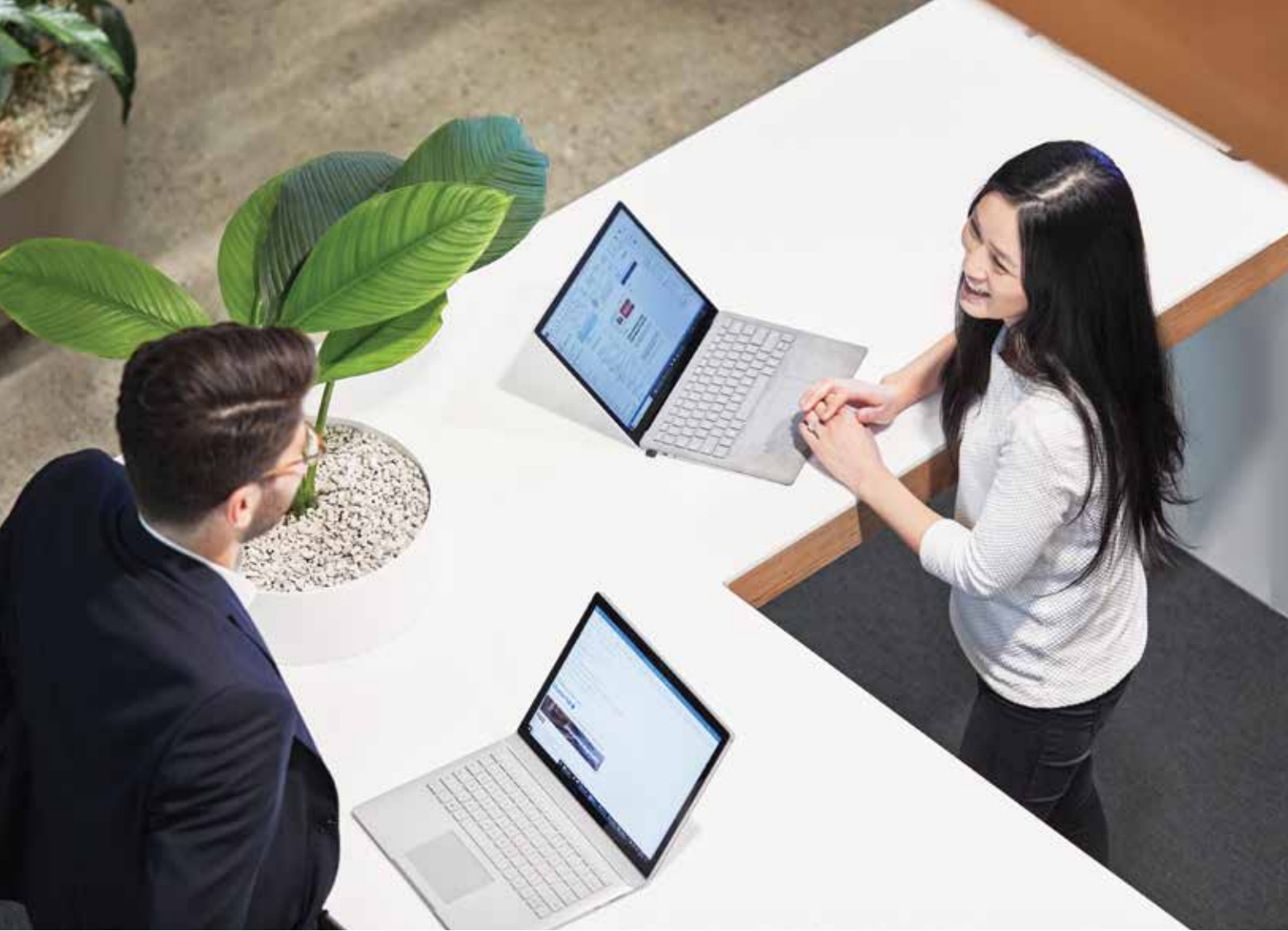
The images in this section 2 are of Charter Hall Group offices, not images of underlying fund properties.